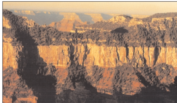
Coconino Sandstone: canyonwide "bathtub ring" of Grand Canyon